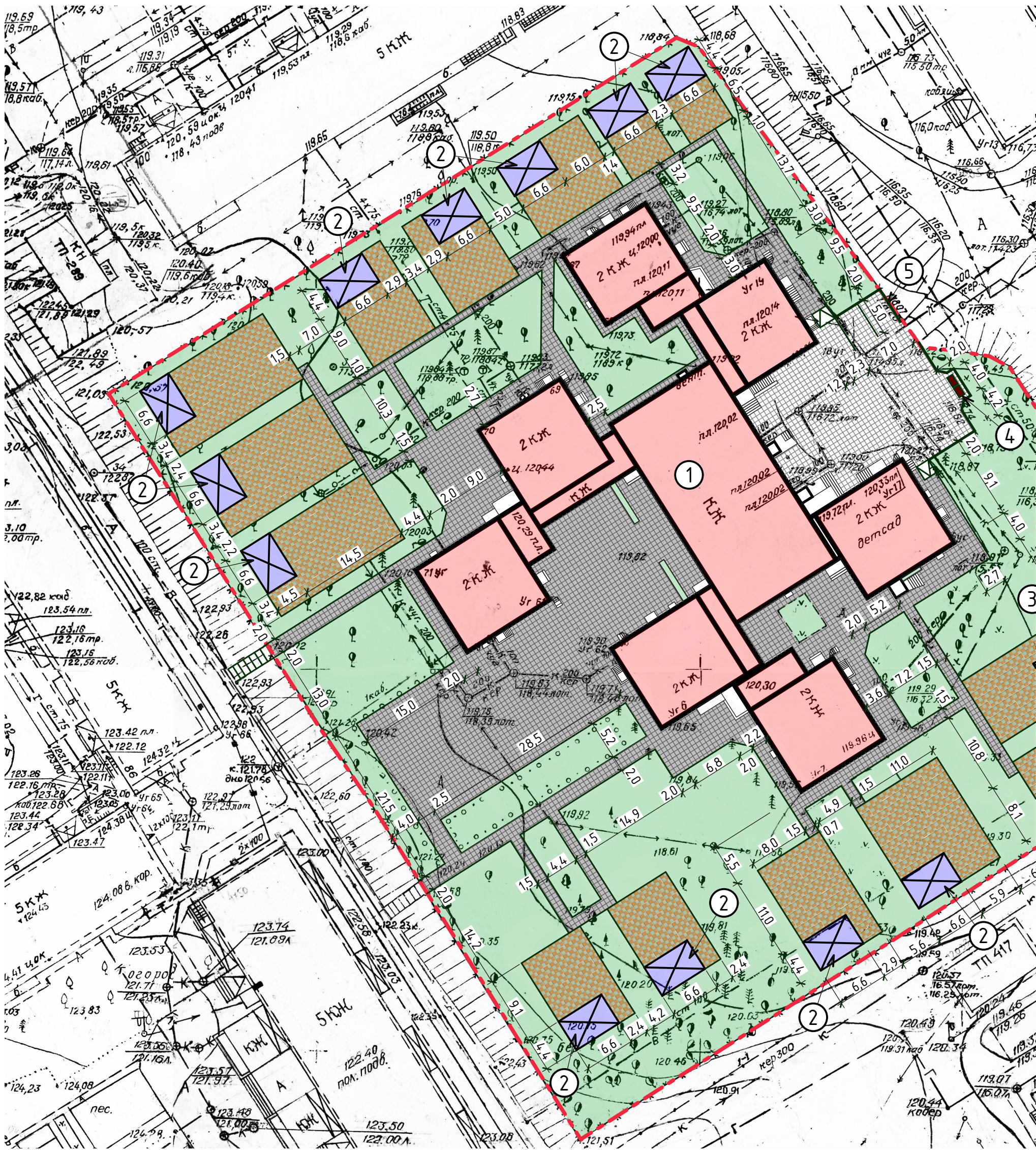
Терен de joaca pentru copii